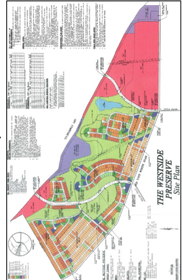
Example Site Plan

COMMENTS: This +/-506 acre site is one of the largest tracts in the area ready for development. All utilities are to the site including water, sewer, electric and telephone. In the Midlothian Independent School District. Approximately ±162 acres zoned commercial with approximately ±35 acres Allowing For Multi-Family (MF-18). Approximately ±233 acres zoned for residential lots (7,000 sf – 14,000± sf). Service road adjacent to Hwy 287 to be completed in sections as each commercial MF tract is developed.